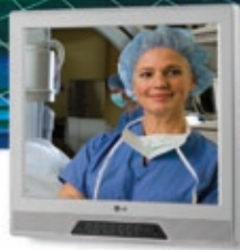
LG 20" LCD Hospital Televisions