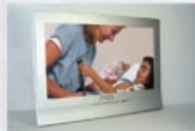
PDi 23" LCD Hospital Televisions