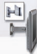
Peerless SP730 Flat-tilt Mount