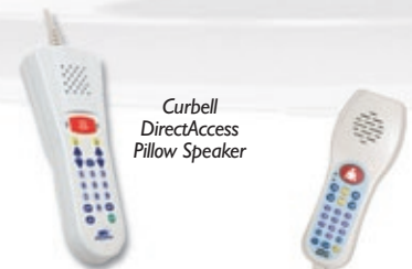
MedTek Series 7 Direct Digital Model

For more information about our products and services please contact