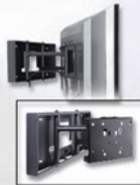
Peerless Articulating Swivel Mount for Plasma and LCD Screens