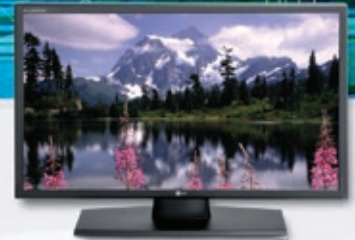
LG 37" and 42" LCD Hospital Televisions