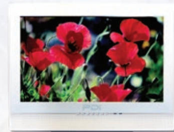
PDi 32" and 40" Hospital Televisions