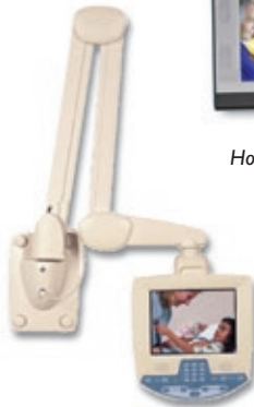
PDi P10 and P15 LCD Hospital Televisions