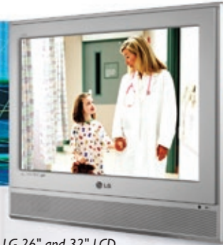
LG 26" and 32" LCD Hospital Televisions