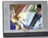
PDi 20" LCD Hospital Televisions