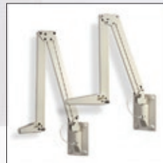
PDi Swing Arm